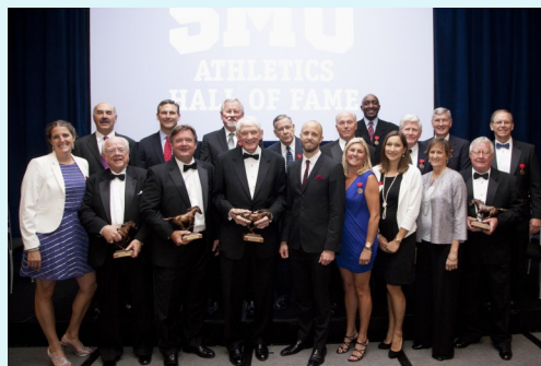
Former Hall of Fame inductees at the 2013 Banquet.

The dinner and induction ceremony will take place on Friday, May 2, at the Hilton Anatole Hotel in Dallas at 7 p.m. Tickets are available for $200 and tables of 10 are available for $1,500. To purchase, call (214) 768-4314, contact the SMU Lettermen's Association at (214) 768-4000, or visit www.smu.edu/halloffame .