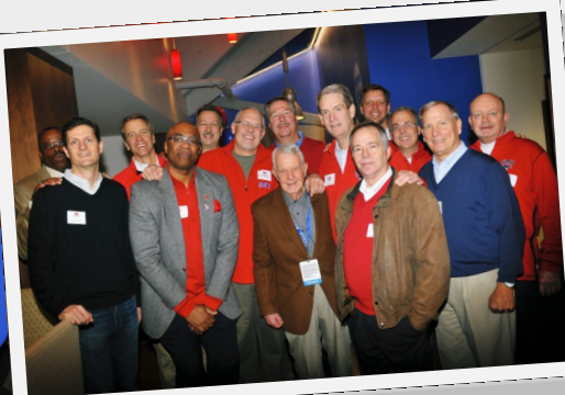
Former SMU Basketball Players gathered with friends and family on January 4th for a reunion before the first games in the new Moody Coliseum.

Have you and your fellow Mustangs been out on the town together lately? Send us a photo so we can feature it in an upcoming newsletter issue!