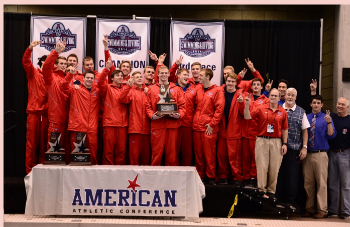
The Men's (left) and Women's (right) Swimming & Diving Teams celebrated their respective runner-up finishes at the first AAC Tournament this February.

The Mustangs compete next in the NCAA Championships, set to take place in Minneapolis, MN (Women's, Diving) and Austin TX (Men's) at the end of March. Visit smumustangs.com for a list of qualifying student-athletes.